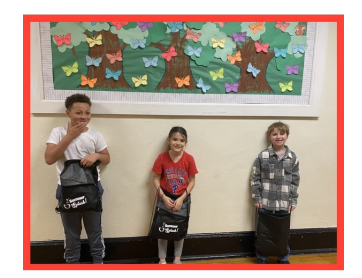
Cafeteria Trey M