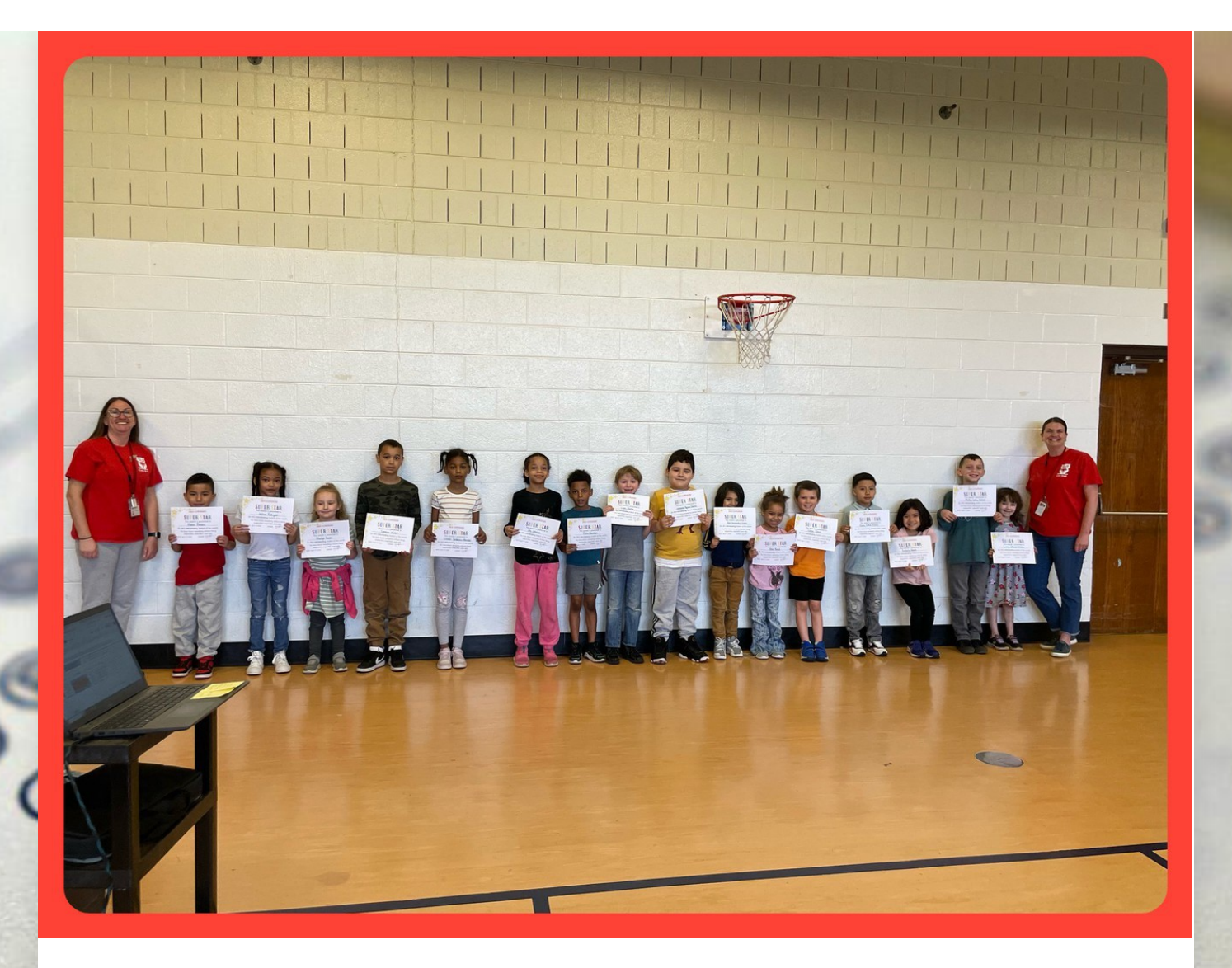
Grades 3-5 Students